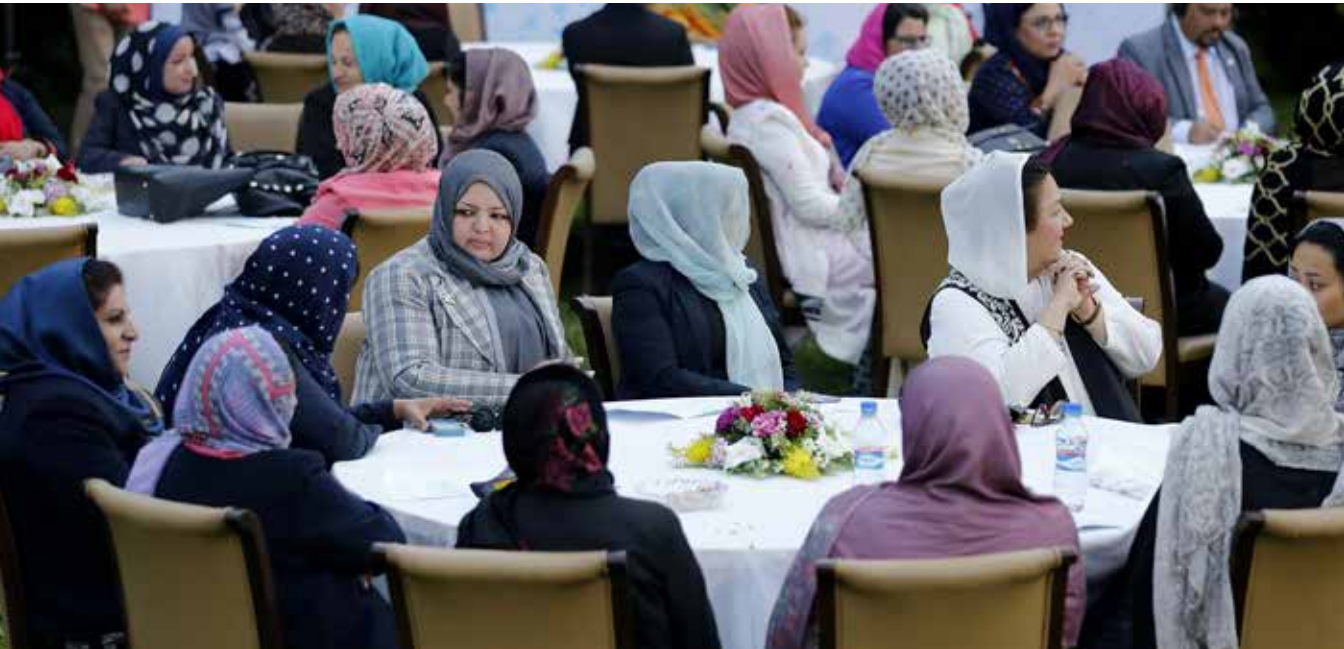
Afghan women from across the country gathered in Kabul to discuss their experiences, vision and contribution to peace in the country at the Fourth Kabul Symposium "Afghan Women: Messengers of Peace" hosted by Afghanistan's First Lady, Rula Ghani.