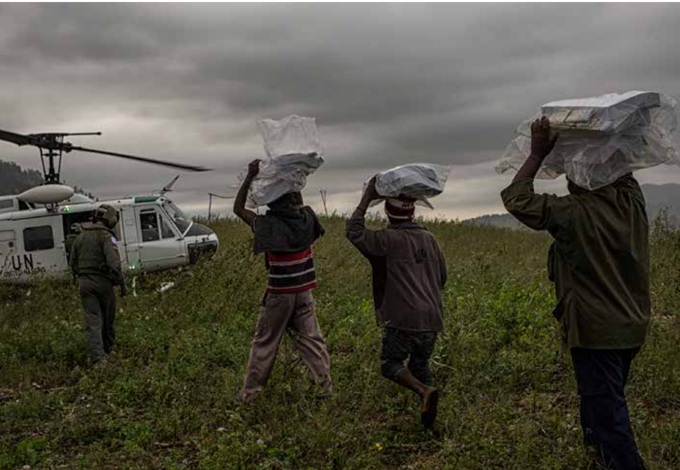
Following Haiti's general elections, held on 20 November 2016, election materials are collected from Anjou, a small town in the mountains above Haiti's capital, Port au Prince, by Chilean peacekeepers serving with the United Nations Mission in Haiti.