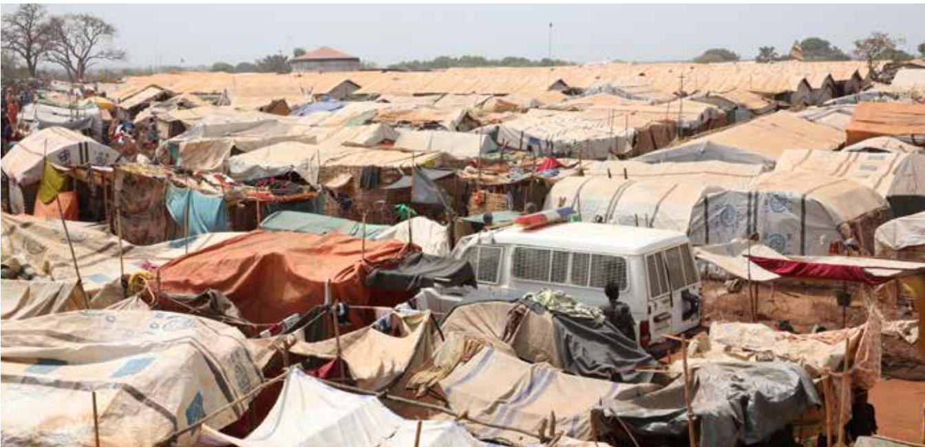
A recent upsurge in violence beginning 10 April 2017 has displaced thousands of people in South Sudan's Wau town.

There was recognition that these matters are complex and require on-going dialogue such as occurred during The Simons Forum. There is need for a regular opportunity to reflect, share experiences and perspectives to refresh and maintain enthusiastic commitment to the implementation of the Responsibility to Protect.