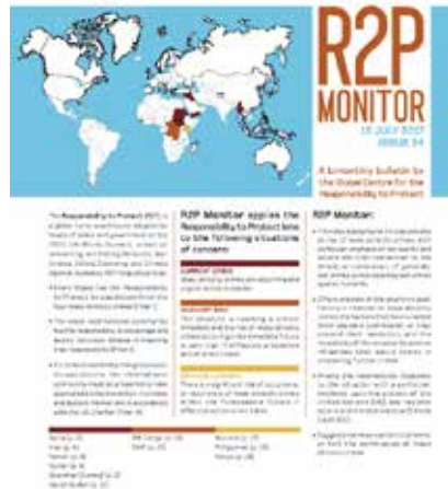
Global Centre for R2P's R2P Monitor is a bimonthly bulletin applying the Responsibility to Protect lens to populations at risk of mass atrocities around the world.

In addition there have been a great many books and articles written on the subject of R2P, and an academic journal – Global Responsibility to Protect – is devoted to it. An entire academic sub-industry has developed dedicated to analyzing, researching and critiquing R2P.