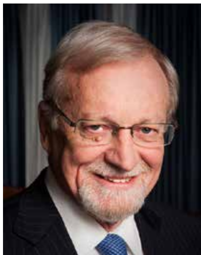
Gareth Evans, SFU Simons Visiting Chair in International Law and Human Security 2016-2017

LOOKING FORWARD The Simons Forum participants agreed that R2P remained highly useful and relevant, with the need for its effective implementation being greater than ever. Just as the 1948 Universal Declaration on Human Rights remains relevant despite a failure to prevent continued abuses, so too does the new R2P norm continue to be of fundamental importance. What is critically necessary is for it to continue to evolve, with ever more effective application in real-world situations.