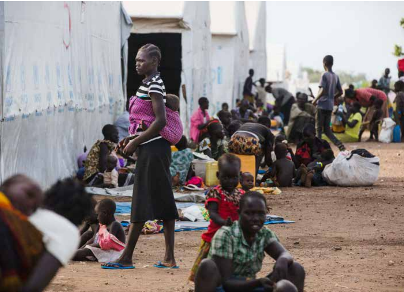
Refugees from South Sudan at the Imvepi refugee camp in Arua district, northern Uganda.