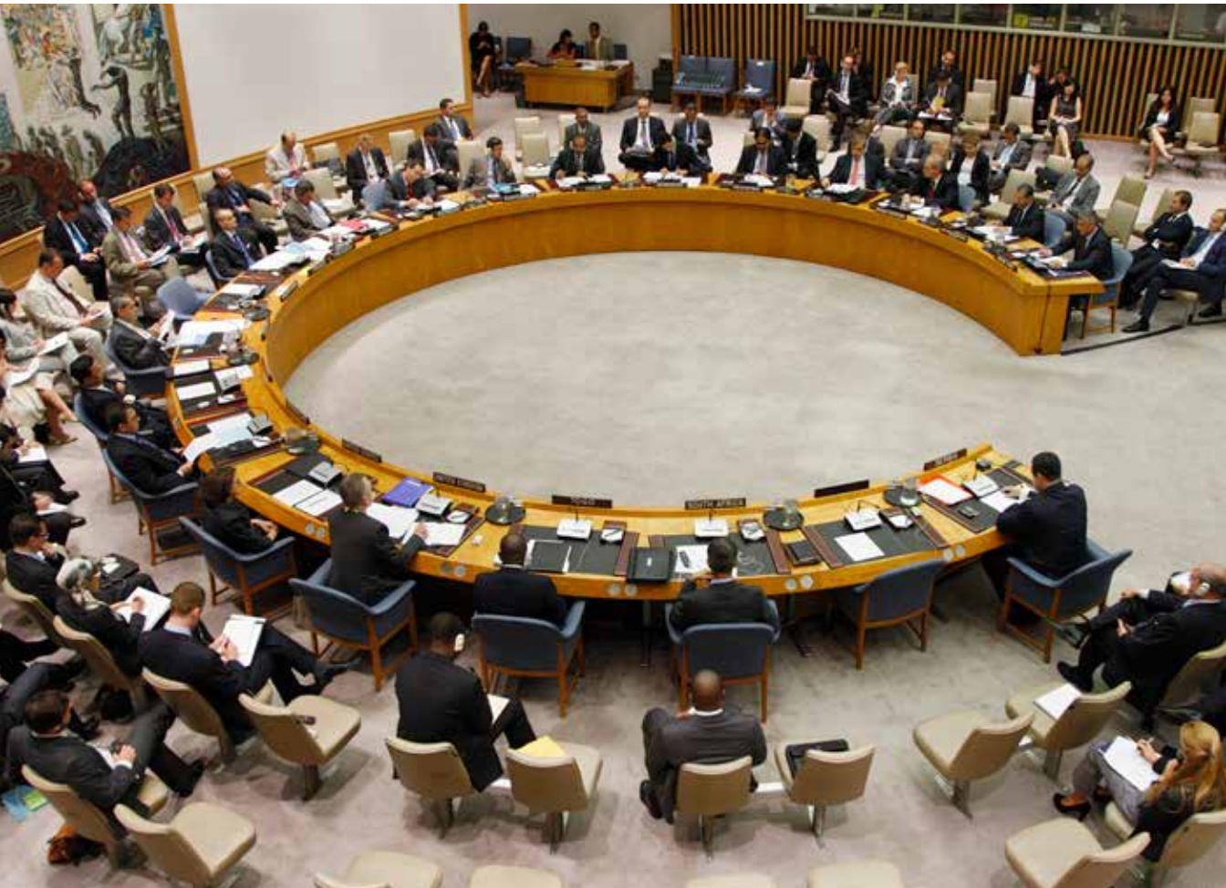
| Security Council Debates Kosovo