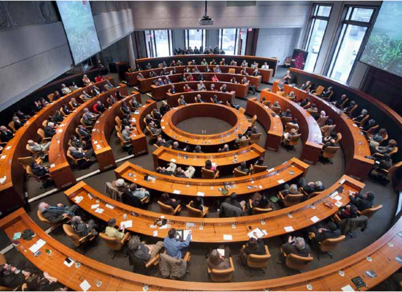
Simon Fraser University Morris J. Wosk Centre for Dialogue, Asia Pacific Hall.