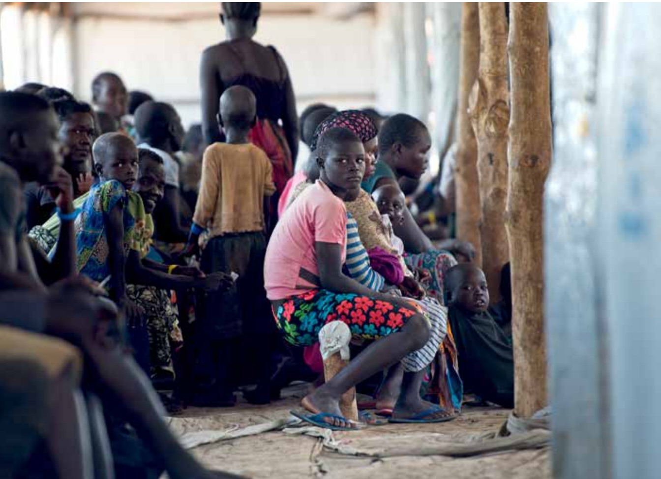
The UN Refugee Agency (UNHCR) and partners opened a new settlement area in Arua district, northern Uganda, in February 2017, to host thousands of refugees arriving from South Sudan.